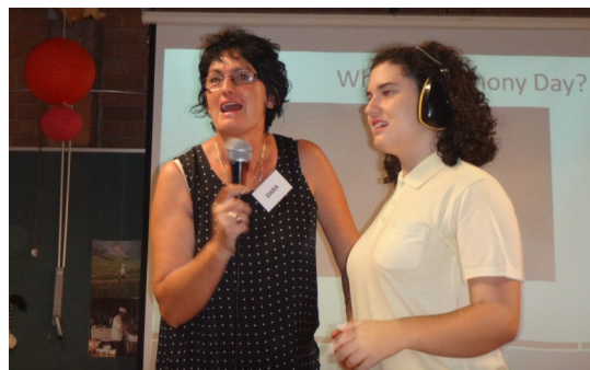
HARMONY DAY ASSEMBLY & GAMES