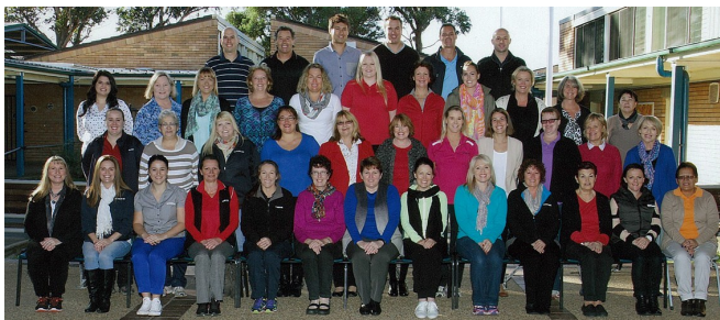
2015 Rogues Gallery

Please let teachers know through communication books if you have any suggestions or concerns.