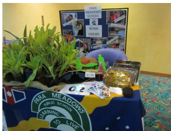
Para Meadows table at the IDO Expo