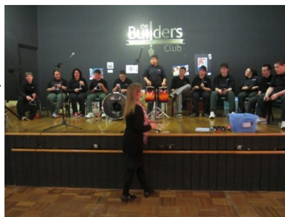
Band performing at the Expo