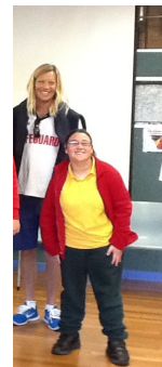
Lifeguard visit HS7 & HS10