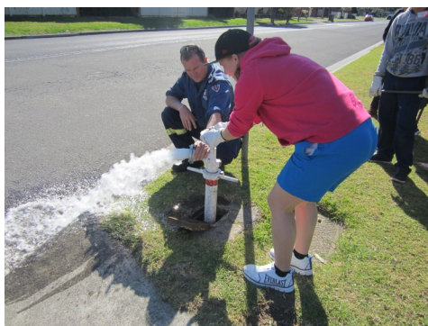
Chloe checks out the street hydrant.