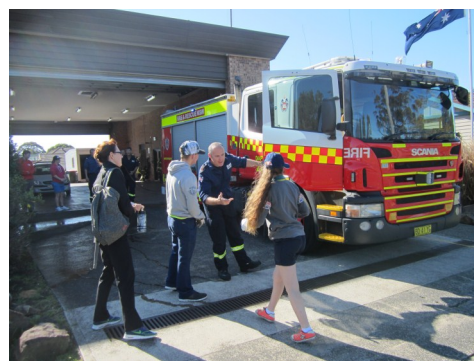
Candice & Jake are shown the safety equipment in the fire truck.