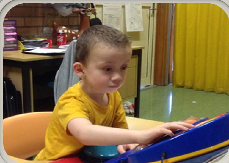
DJ using one of the class cause and effect toys