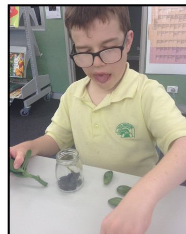
Making terrariums for Mother's Day.