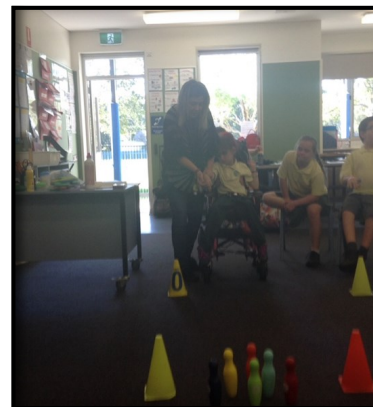
Students enjoying a bowling lesson while learning how to keep score on a graph!