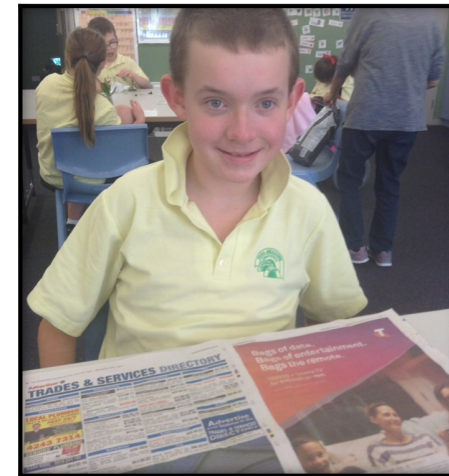
Learning about class structure in Ancient Egypt!