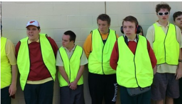
The team with the tallest tower!