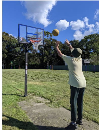
We love the basketball hoop.