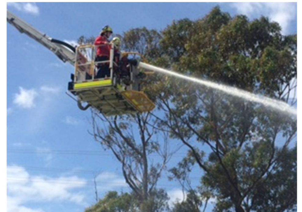
The highlight of Term 3 was Zachary using the fire hose at the graduation day of the Workers of Wollongong program.